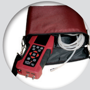
Convenient nylon bag