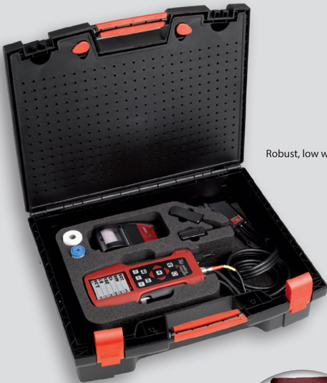
Robust, low weight case